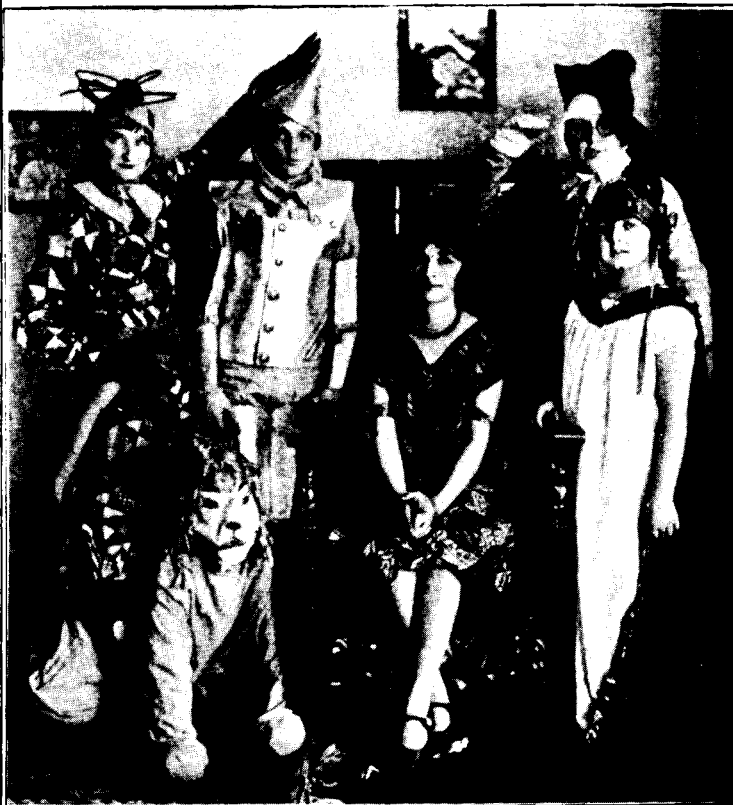
The Ozmagopolitan staff photographer attended the play "A Day in Oz," presented in Washington, D. of C., the capital city of the U. S. A., and by special request of Queen Ozma, the Royal Historian of Oz, Ruth Plumly Thompson, posed with the cast before his magical camera.